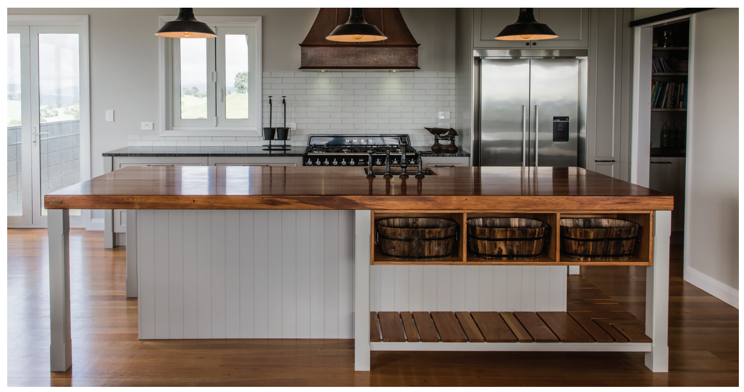
RECYCLED RIMU - KITCHEN & INTERIOR CO.

If you have any problems with your bench top, The Woodsmiths will be there to rectify it within 7 days.