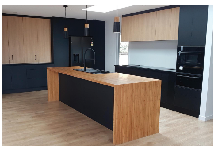
ECO - BAMBOO