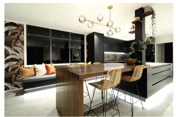
STAINED OAK - KITCHEN STUDIO NORTH SHORE

Make a statement in style and quality with Solid Wood Bench Tops by THE WOODSMITHS. Over a quarter of a century dedicated to enduring timber craftsmanship has made our badge synonymous with luxury and bespoke excellence. This commitment to quality and technical expertise is the reason we have been privileged to showcase the warmth of solid wood in some of the finest residential, hospitality and commercial interiors NZ wide.