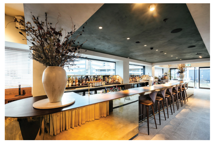
STAINED OAK BAR TOP - NORTHERN CLUB, DBJ